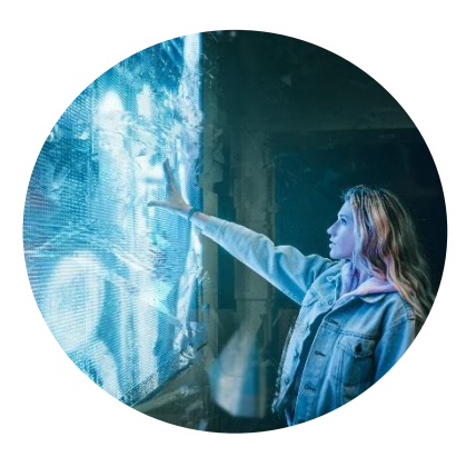
Galvanise the 5G Ecosystem

5G will open many doors by creating new jobs, services, skills and products into Scottish businesses, attracting new talent across the globe and investing in future generations.